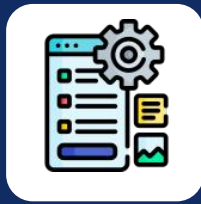
Custom Workflow Configuration