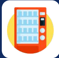
Smart Storage & Vending