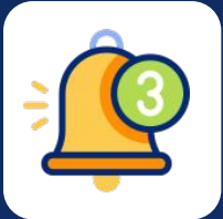
Real-Time Notifications & Alert