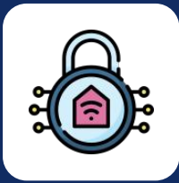
Secure Smart Locker Infrastructure