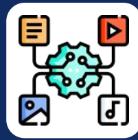
Enterprise System Integration