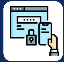
Multimodal Authentication & Access