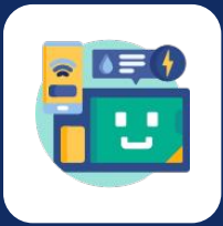
Automated Insurance & Return