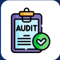
Audit & Compliance Ready