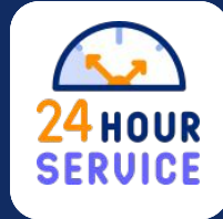
24x7 Automated Asset Access